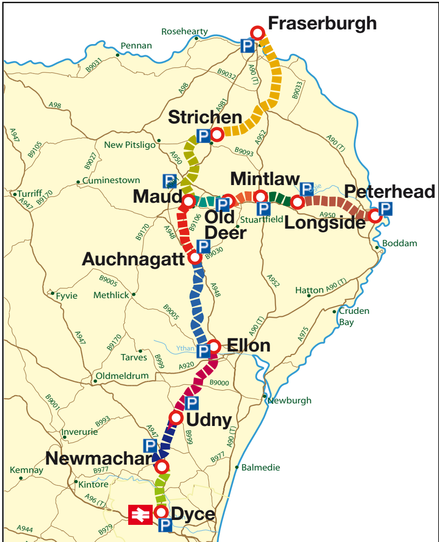
Based on Ordnance Survey mapping. © Crown copyright reserved. Aberdeenshire Council, 0100020767 (2010).