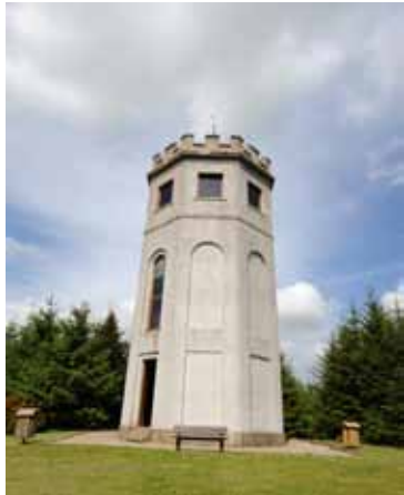
Drinnies Wood Observatory

Maud was the main junction to Peterhead and from here you turn eastwards following the valley of the South Ugie Water. On this route you pass Old Deer which is a quaint little country village, situated beside Deer Abbey. It is surrounded by rolling hillsides and mediaeval landmarks.