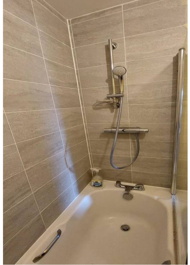
Alternative View of Bathroom