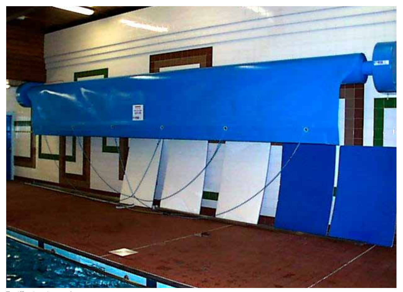
Turriff swimming pool cover

% change symbols \sqrt{\ } = right direction X = wrong direction