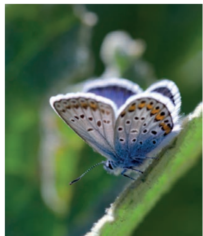
Common blue butterfly