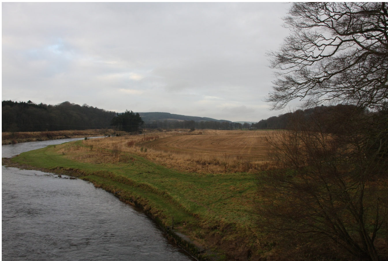
24(i) The broad, shallow valley landform and the River Deveron give this area a higher degree of sensitivity to wind energy development than the surrounding Agricultural Heartland farmland.

In Banff and Buchan is the Deveron and Upper Ythan Valley , which is a shallow valley that flows out to the sea at Macduff. Its sides are clothed with a mix of broadleaved and conifer woodlands and its floor has farmland running to the river's edge. Its shelter has resulted in settlements such as Turriff, Fyvie and large estates resulting in five HGDLs. It is an attractive river valley with a high degree of integrity.