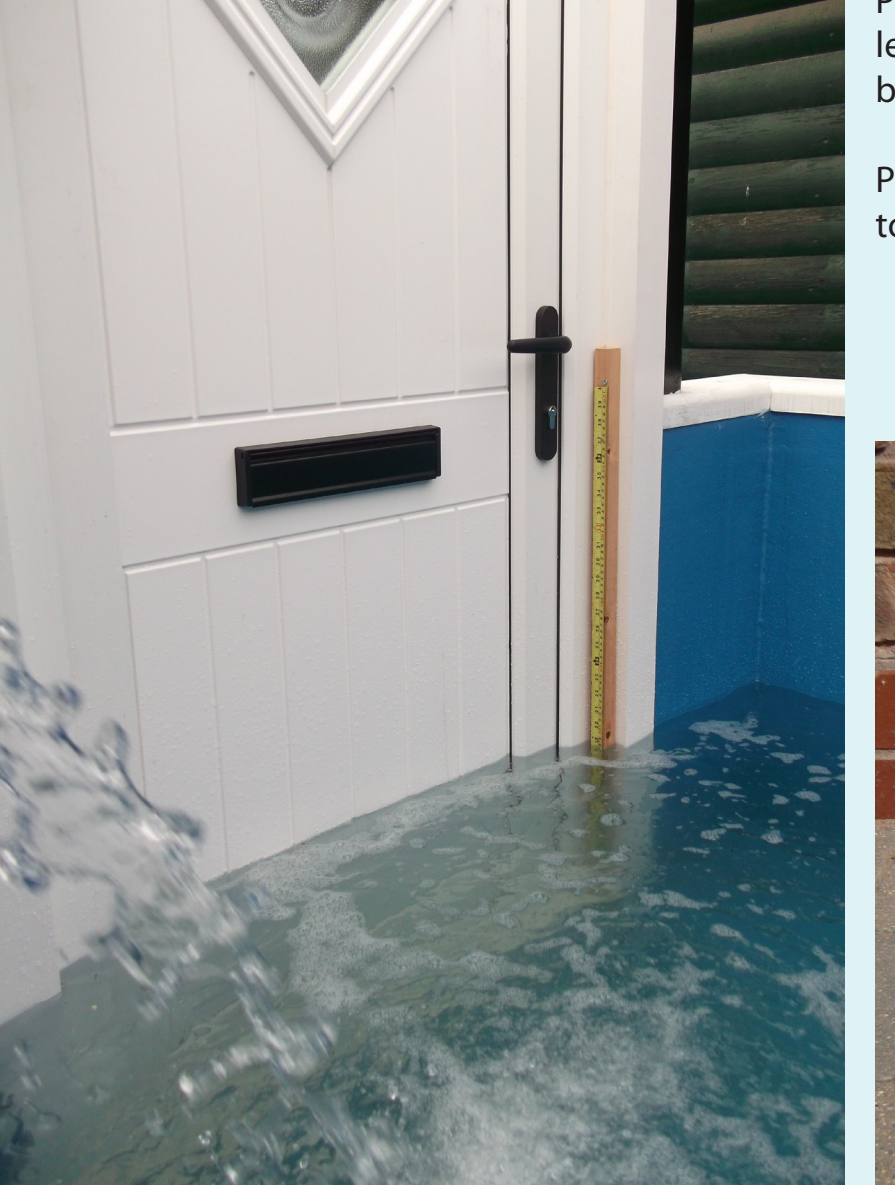
Property Level Protection measures, including [top left, bottom right] door barriers; [top right] temporary barriers, reinforced with sandbags; [below] air brick cover.

Products should be tested to BSI standards and conform to Kitemark quality and reliability standards.