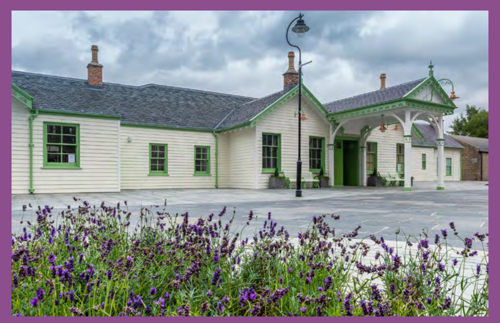
Ballater Station officially re-opened 20 August 2018