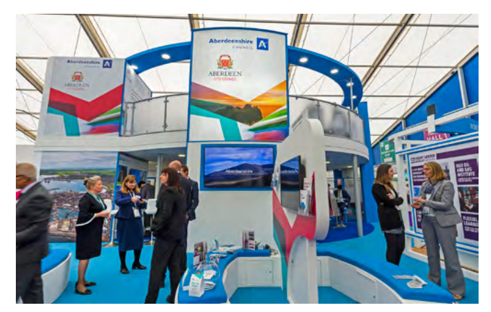
Offshore Europe 2017

The energy sector remains a vital component of the Aberdeenshire economy despite a challenging few years. Encouraging signs indicate an improvement in trading conditions in the industry. The price of Brent rose above $70in early 2018 for the first time in three years and the reduction in jobs in the sector fell to 4%. This latter figure is still disappointing but it is an improvement on the 35% overall reduction since the downturn began and there are increasing examples of companies recruiting again.