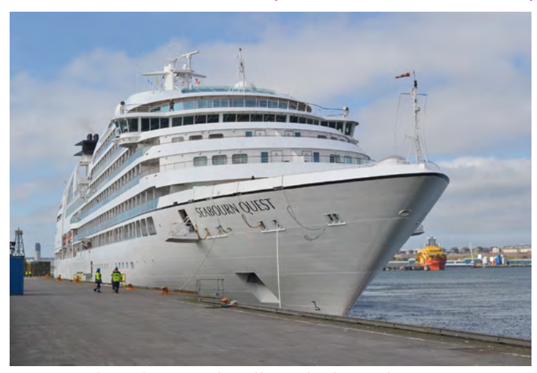
Luxury cruise ship, Seabourn Quest hosted by Peterhead Port Authority

Visit Aberdeenshire, jointly funded by Aberdeenshire Council, Opportunity North East and Aberdeen City Council is the Destination Management Organisation (DMO) for tourism in Aberdeenshire and Aberdeen. The main objective of Visit Aberdeenshire is to drive sustainable growth of the visitor economy of Aberdeenshire and Aberdeen through strategic leadership and coordination of destination development and marketing and to improve the accommodation and service offering of hospitality providers and visitor attractions.