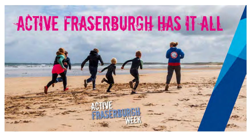
Enjoying a leisurely beach run during Active Fraserburgh Week

Fraserburgh is fast becoming a town known for its exceptional indoor and outdoor sports and recreation facilities. With the new South Links development (running, athletics, all abilities cycling and football), nearing final completion and inspirational plans to create state of the art competition standard squash courts at the Fraserburgh Fitness Centre, the town is the place to go for any sporting enthusiast!