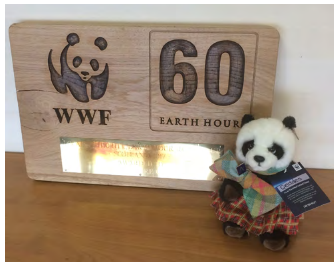
World Wide Fund for Nature (WWF) Runner-up award and Geddes the Panda

Scotland is committed to playing its part in honouring the Paris Agreement, the central aim of which is keeping global temperature rise this century well below 2 degrees Celsius above preindustrial levels.