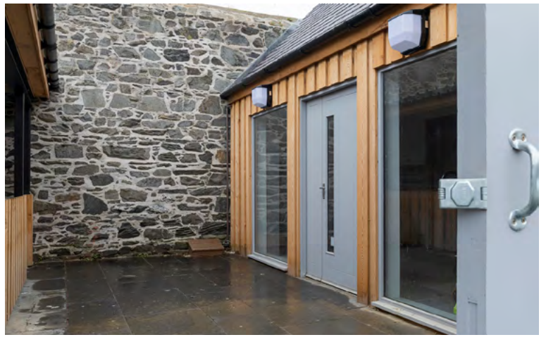
The Smiddy: Centre of Excellence of Silversmith and Jewellery, Banff

In 2017/18 Aberdeenshire Council launched a new fund to support social enterprises.