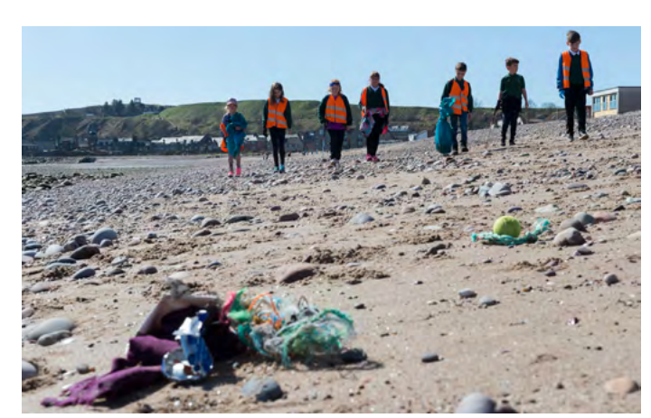
Big Spring Beach Clean with Mill O' Forest School on Stonehaven Beach

part of the European Maritime and Fisheries Fund (EMFF)