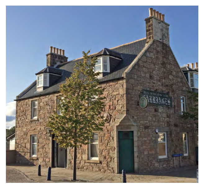
Newly refurbished Station Hotel at Insch

Four Business Development Executives offer business support throughout Aberdeenshire from bases across the area. This generalist business support and advice complements the work of specialist industry advisors, the InvestAberdeen team and regeneration staff.