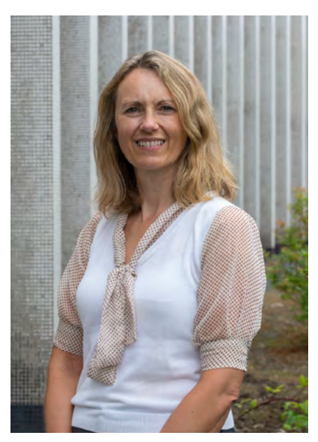
Head of Economic Development and Protective

The Economic Development Service is here to support and advise businesses and social enterprises, so please get in touch with us.