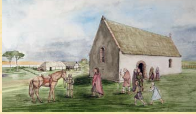
Reconstruction illustrating the Chapel in the high medieval period.

The plain architectural form and general finishes of the chapel would have been in sharp contrast to the workmanship on the decorative detailing of the window and doorway openings.