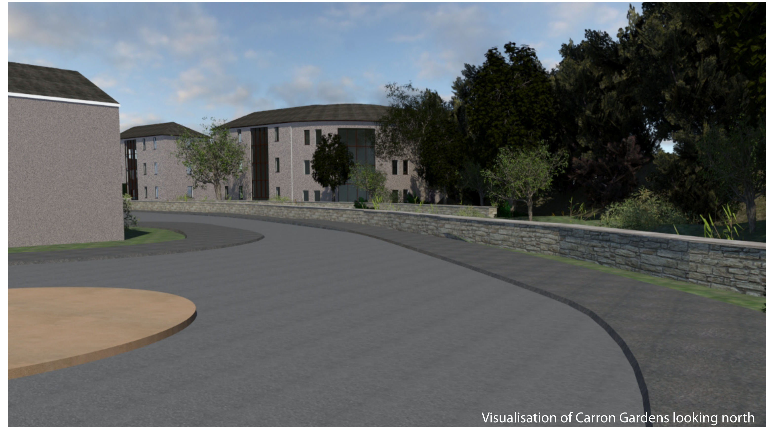
Visualisation of Carron Gardens looking north

To match the surroundings, the walls are likely to have a 'harled' finish with stone copings. Some trees will need to be removed; these will be replaced with similar species.