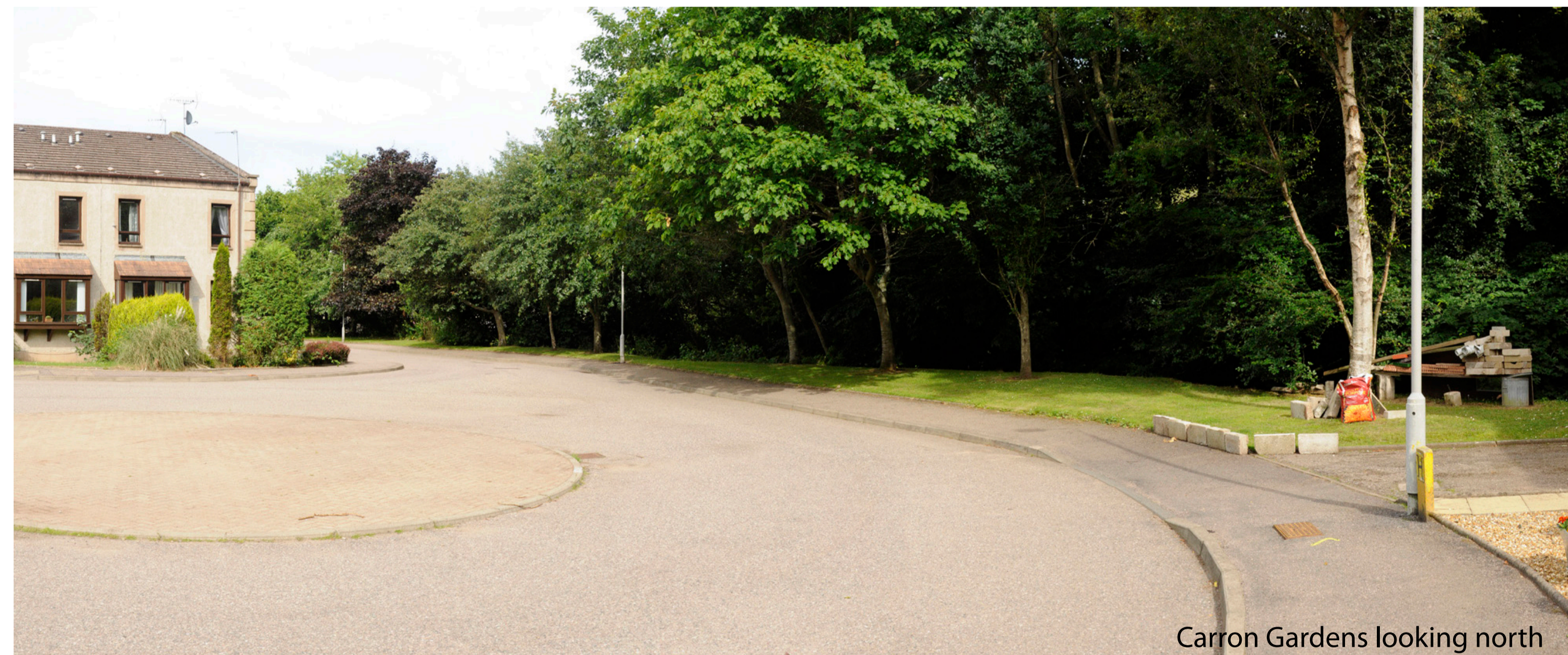
Carron Gardens looking north