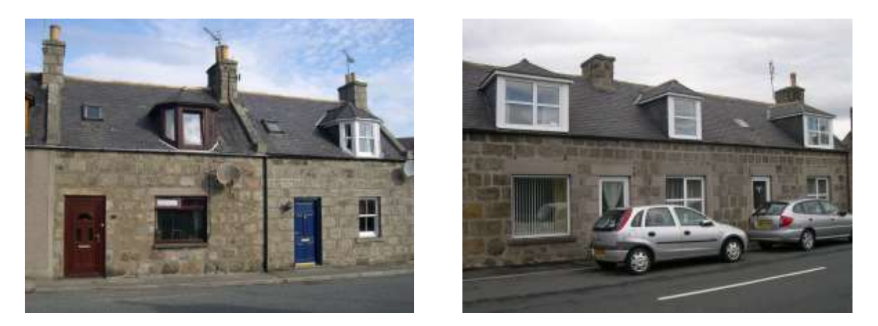
Replacement PVCu double glazed windows in a variety of glazing patterns, opening styles, quality and finish. The property second from the left with the blue door is the most successful of these in retaining some resemblance to its original character.

Most traditional windows of timber construction can be repaired and refurbished back into proper use or into an enhanced condition. Some existing timber sashes can be altered to accept double glazed units. By using traditional internal shutters or double windows heat loss and energy consumption can be reduced. Where the choice is made to replace an existing window then some windows and factory produced products are more successful than others in helping to retain a sense of original character.