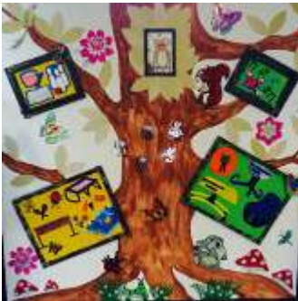
West Wing Tree of Support