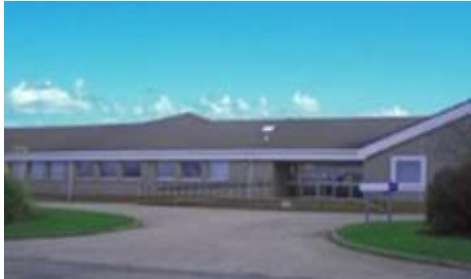
Car parking and easy access

Within the Resource centre people can receive: Personal care Behavioural Support Use of up to date equipment and resources which are also accessed by the wider community, these include the Spa Bath, Snoezlen, Cool Zone, Games Pad and electronic interactive equipment.