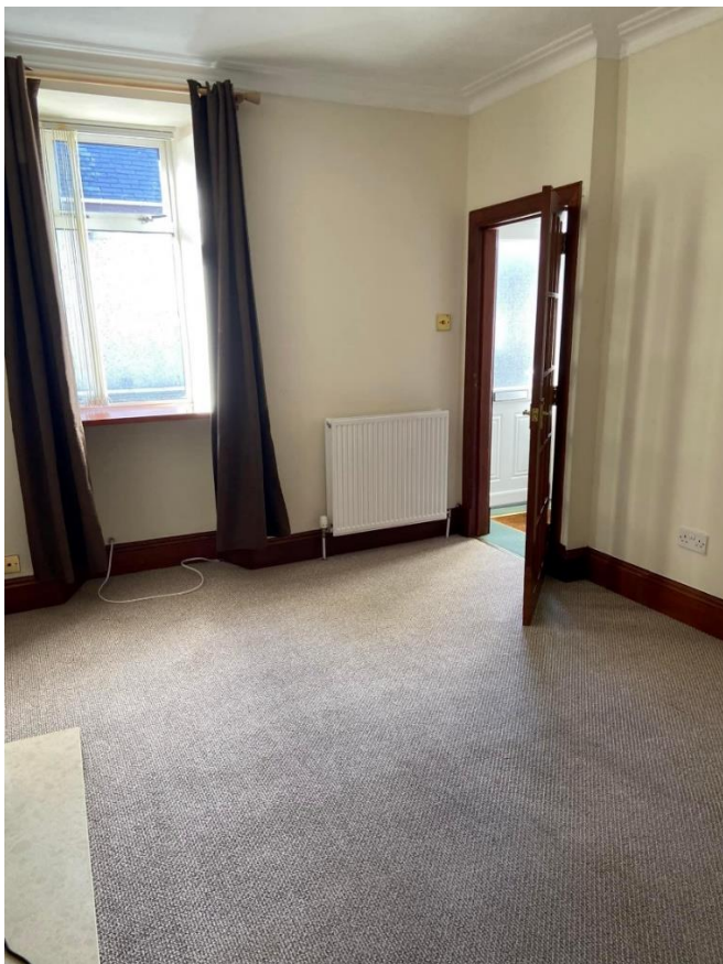
Alternate view of Living Room