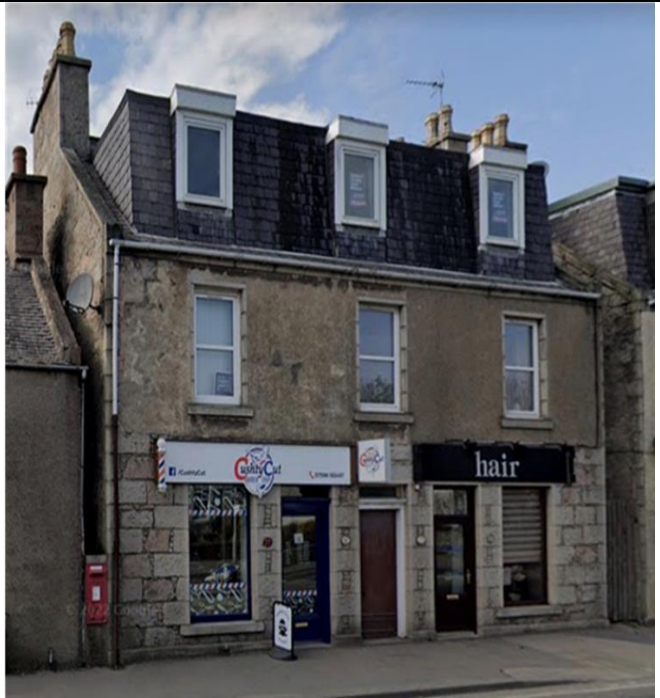
View from front of the house