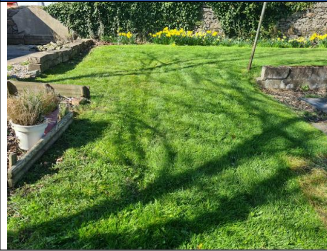
Garden (shared portion)