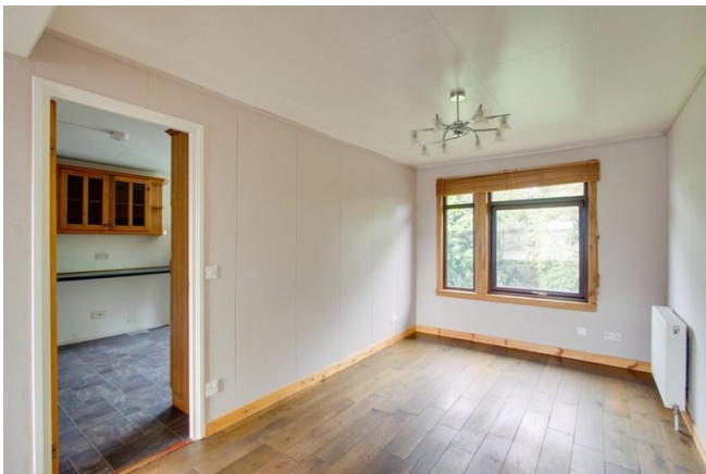
Living Room Back