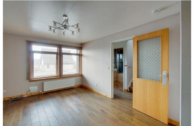
Living Room Front