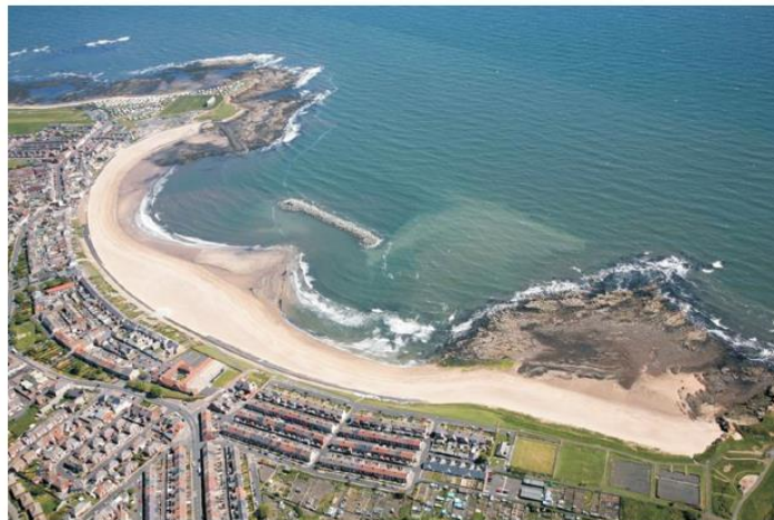
Figure 4-1: Example salient formation in the lee of a detached breakwater at Newbiggin Bay (CIRIA, 2010)

A salient is likely to be formed in the lee of the structure due to the lower energy environment created. A typical salient formation is shown in Figure 4-1 at Newbiggin Bay, Northumberland. It is possible that this deposition may block the River Carron channel or cause a southerly migration of the river.