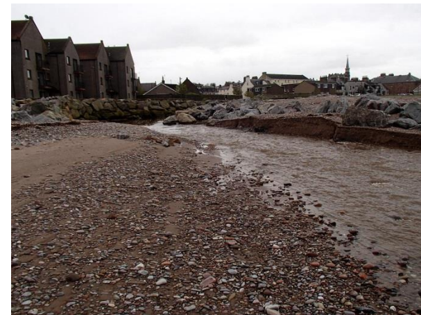
Figure 2-1: Plan layout (above), Photo 1 looking southeast (top right) Photo 2 looking northwest (bottom right).