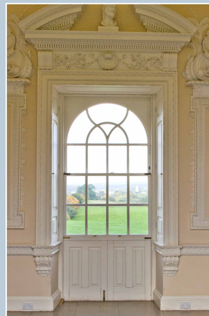
This original window/door of the 1730s at Chatelherault, Hamilton, illustrates the principle of converting a window to a door. In order to maintain the consistency of architectural treatment in the room, the upper part of the door is treated as a window, and the lower section is solid.