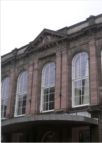
Webster Theatre, Arbroath. Large clear sheets of internal secondary glazing were installed here during recent refurbishment.