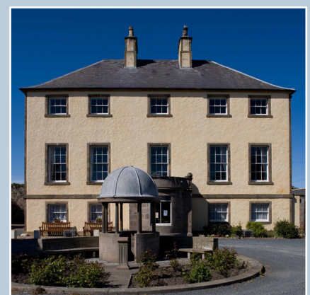
Banff Castle, Aberdeenshire. Here the size of the windows at the first floor indicate that this was the principal storey where the public rooms were located. The symmetrical arrangement and careful proportioning of the windows is the main architectural feature of the building.