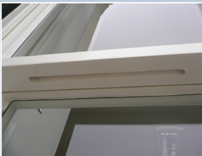
A view of the underside of the meeting rail of a new timber sash and case window at Castlemilk Stables, Glasgow. A discreet slot ventilator in the meeting rail allows ventilation without the need for obtrusive external fixtures.