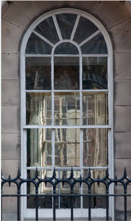
Signet Library, Parliament Square, Edinburgh, circa 1810. A round-headed cylinder glass sash and case window with slim 'astragals', or glazing bars. Irregularities in the glass provide the variety and individuality of the reflective pattern.