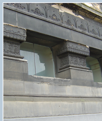
St Vincent Street Church by Alexander 'Greek' Thomson, St Vincent Street, Glasgow. Thomson's Graeco-Egyptian designs emphasised the solid monumentality of the masonry against the void of the window openings. He used large sheets of plate glass and minimal frames to achieve this effect.