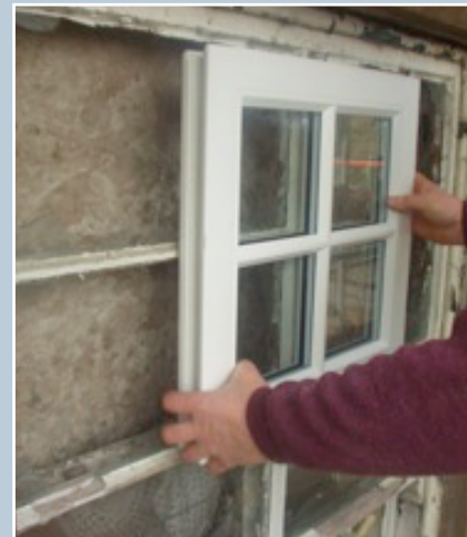
Details of proposed replacement windows should be checked against the originals where possible. In this case the astragal profiles of the sample replacement window are too thick and flat, and would not be an appropriate match for this situation.