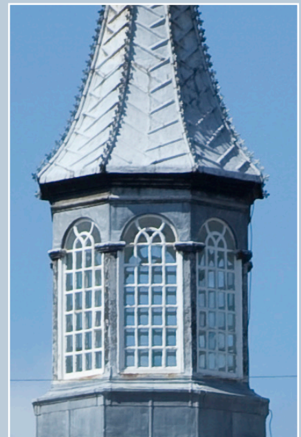
Fixed small-pane windows in the cupola of Robert Gordon's Hospital, Aberdeen, designed by William Adam in 1731–32. Thick astragals (glazing bars) and small panes of glass are typical of this period of design.