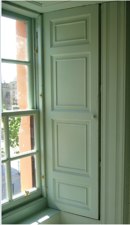
Associated fixtures such as traditional timber shutters contribute to the interest and character of a window.