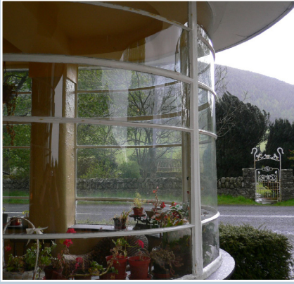
A distinctive, metal framed bay window at the Crook Inn, Tweedsmuir, Peebleshire.