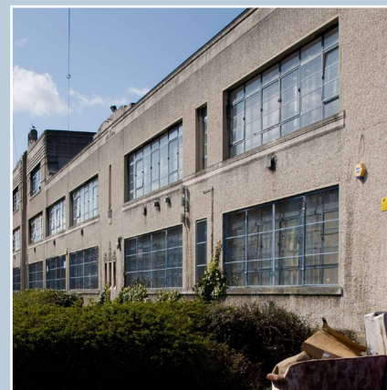
Former Niddrie Marischal School, Edinburgh. Designed in Art Deco style in 1935 by architects Reid & Forbes. The strips of blue-painted steel windows have two opening methods: horizontal pivots and small hoppers. The ground-floor windows are protected from vandalism by discreet metal mesh screens painted in the same colour.