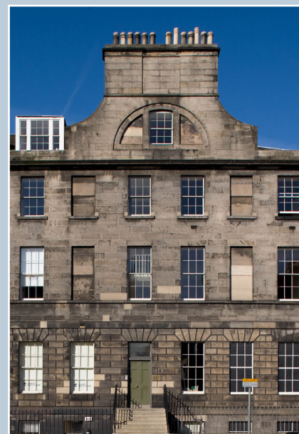
South Charlotte Street, Edinburgh. The blind openings are detailed with sills and a 'meeting rail' to maintain the symmetry of the architectural elevation. The chimney flues pass behind the blind windows.