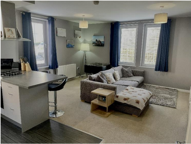
Living Room Area