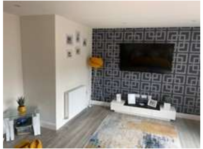
Alternative View of Living Room Area