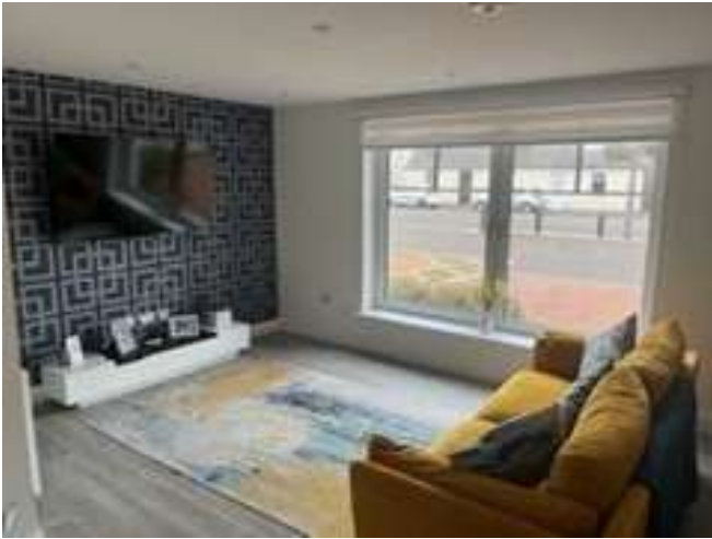
Living Room Area