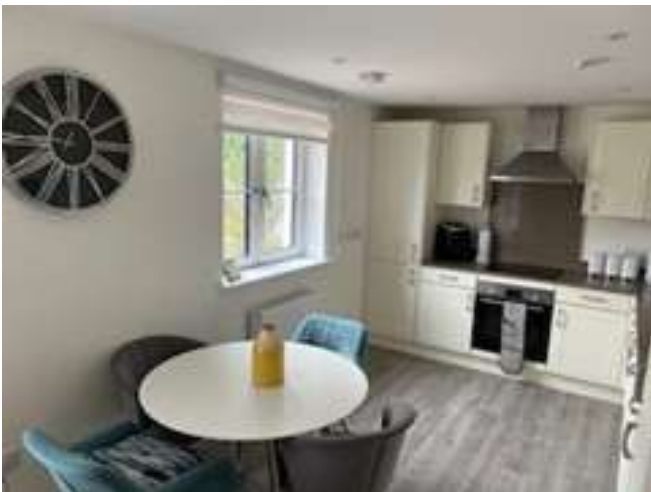
Dining Kitchen Area